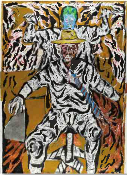
OMER'S CHARACTERS suggest physical strength alongside vulnerability. (Ariel Yannay Shani)

There is a pervading sense of yin-yang counterbalance between Heavy Air and the neighboring Nephilim showing by Noam Omer. It is a suitably named spread, with the reference to the biblical outsized characters inferring great physical strength but also vulnerability, much like Ron-Gilboa's offering.