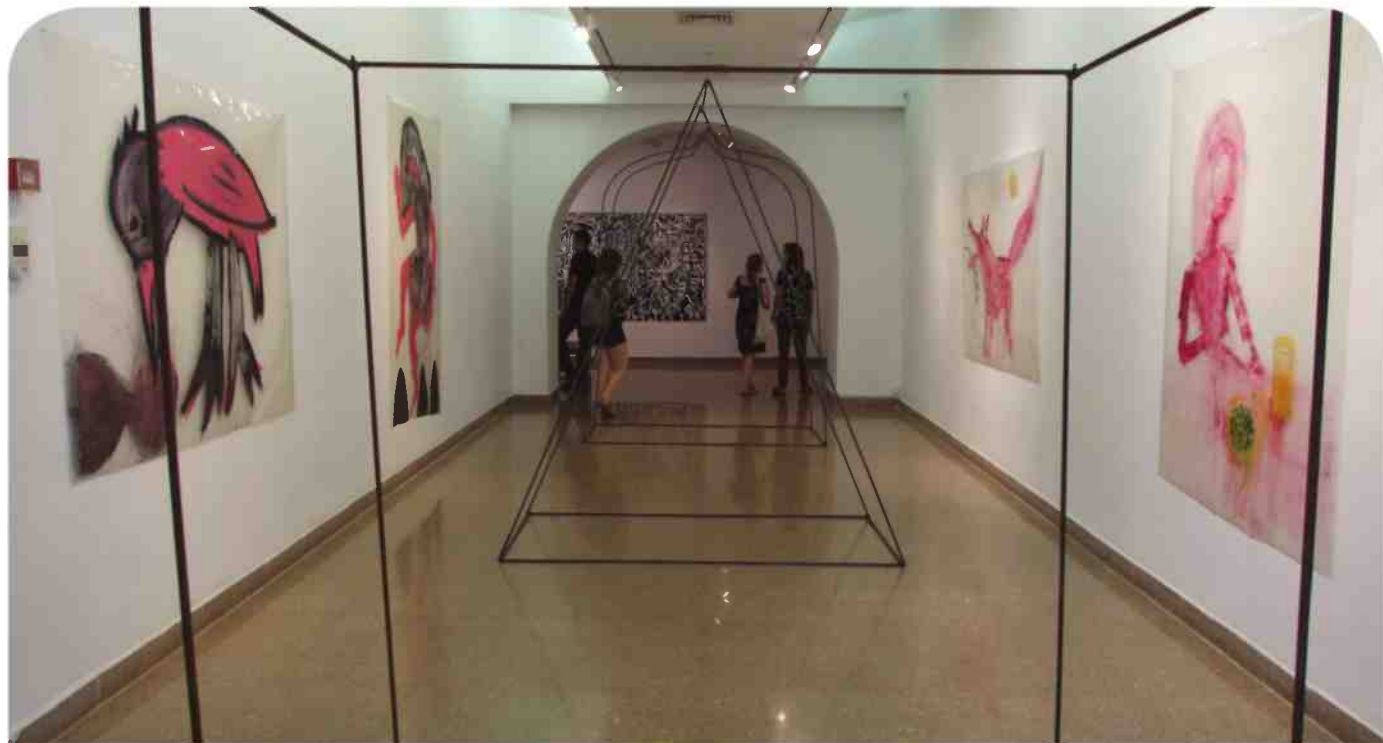
INSIDE AND OUTSIDE overlap in Itai Ron-Gilboa's "Heavy Air" installation-exhibition. (Elad Sarig)